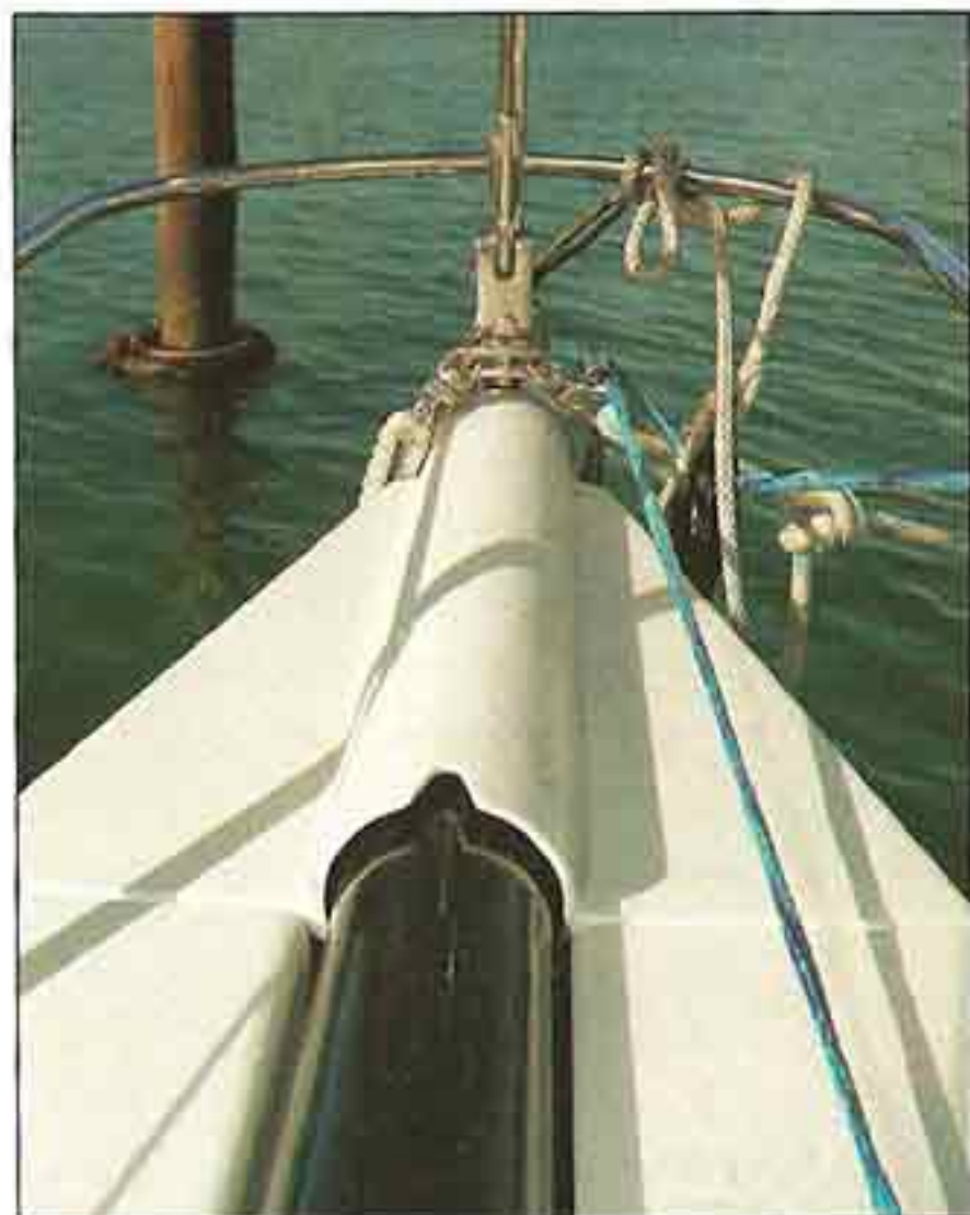
FROM TOP: The rotating, retracting prod; ocean racing galley with bench, stove and sink; home, sweet home.